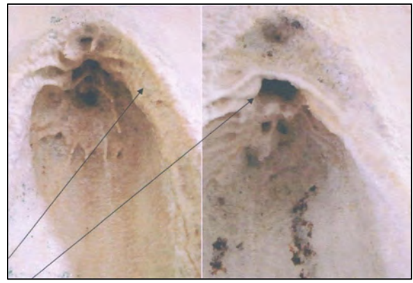
Choked Drain in Gallery