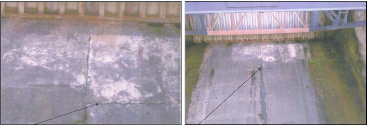
Crack & Leakage seen in Glacis Portion