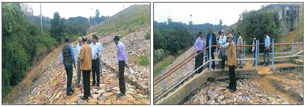
Disturbed u/s rip-rap/ pitching

Figures 1.1 and 1.2 provide photographs of key infrastructure proposed for rehabilitation works and also major interventions locations.