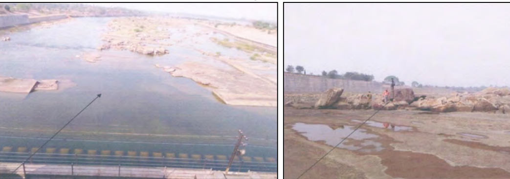
Damaged Portion of End Sill